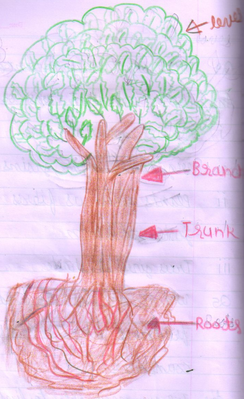
Parts of a tree